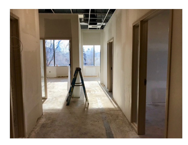
The staff office hallway