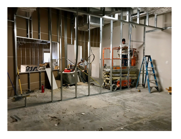
Workers install the wall between the cry room and the library.