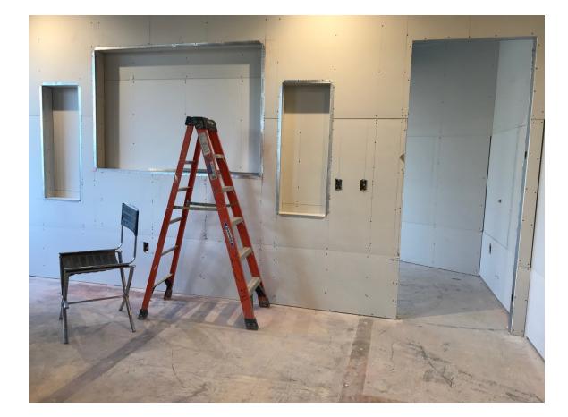
Altar Niches in the Chapel have been completed.

During November we received our final building permits from Fairfax County and work at our new building is moving forward. Our target occupancy date is January 22.