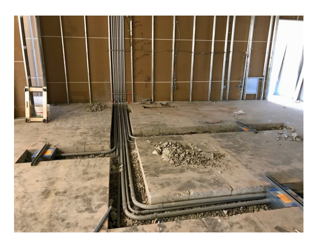
Conduits for audio wiring are being laid in the floor for Epiphany's musicians.