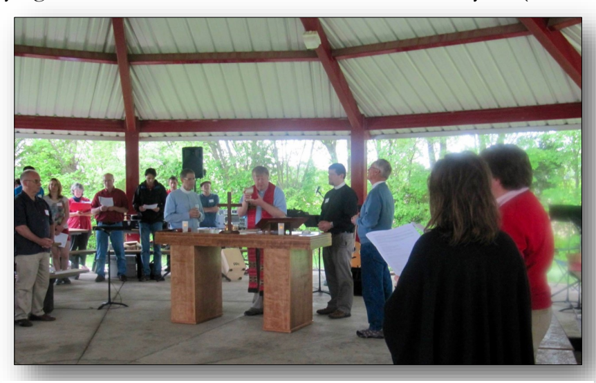
Pentecost in the Park will be at Frying Pan Park on June 4th.

thankfully continue to have use of our current facility), it's especially good to remind ourselves that Epiphany is a people, not just a place. We continue this tradition, not only because it's fun to be outside and eat a meal together, but because it reminds us both about how God has taken care of Church of the Epiphany in the past, and how we can boldly walk with him into the future.