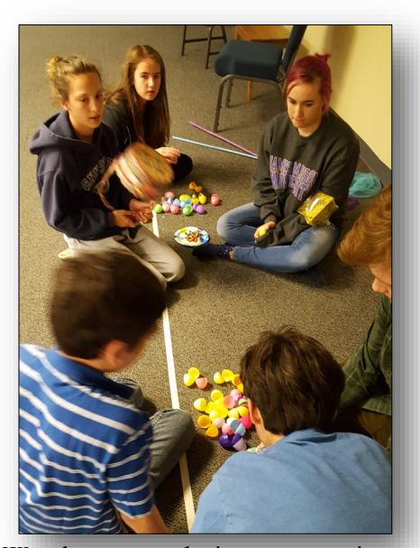
We play games during our meetings. Here, youth have fun counting their collected M&M's

Sometimes I wonder if you really care. God, are you really there? Do you hear my prayer?