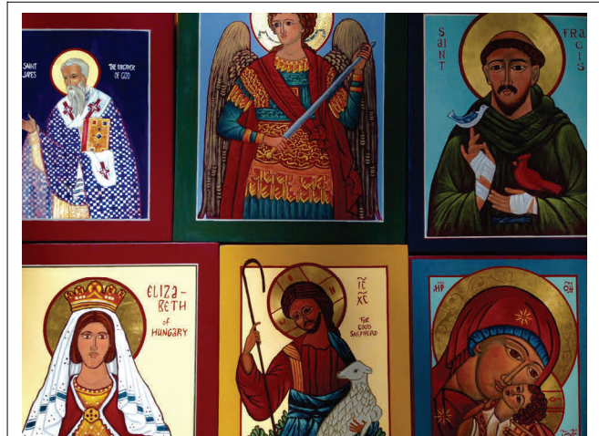
Some of the icons painted by Epiphany members which will be on display in the sanctuary this Advent.