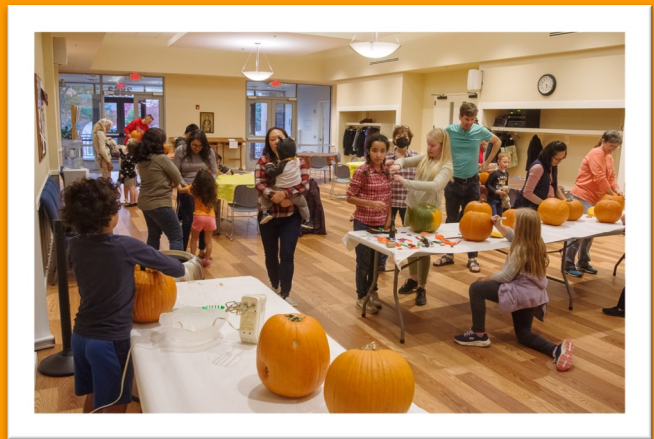
About 40 kids and adults came out for the evening.