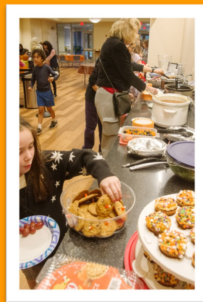
Good food always makes it more fun.