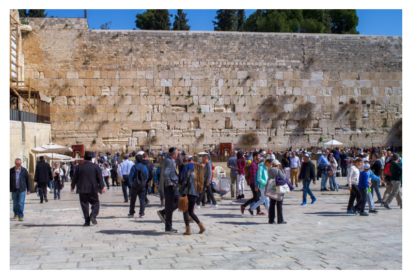
Going to the Western Wall (or as it is sometimes called, the Wailing Wall) where Jews have prayed since the destruction of the Temple by the Romans in AD 70 is an amazing experience.