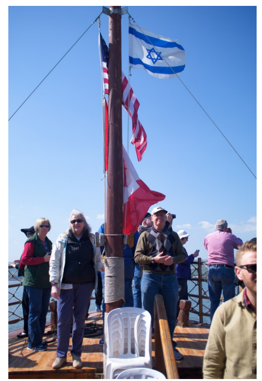
Sailing on the Sea of Galilee.