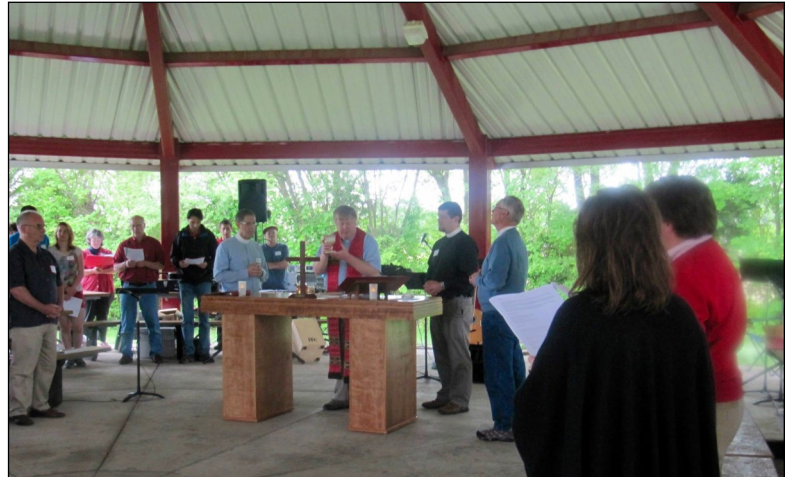
Pentecost in the Park will be at Frying Pan Park on May 15.