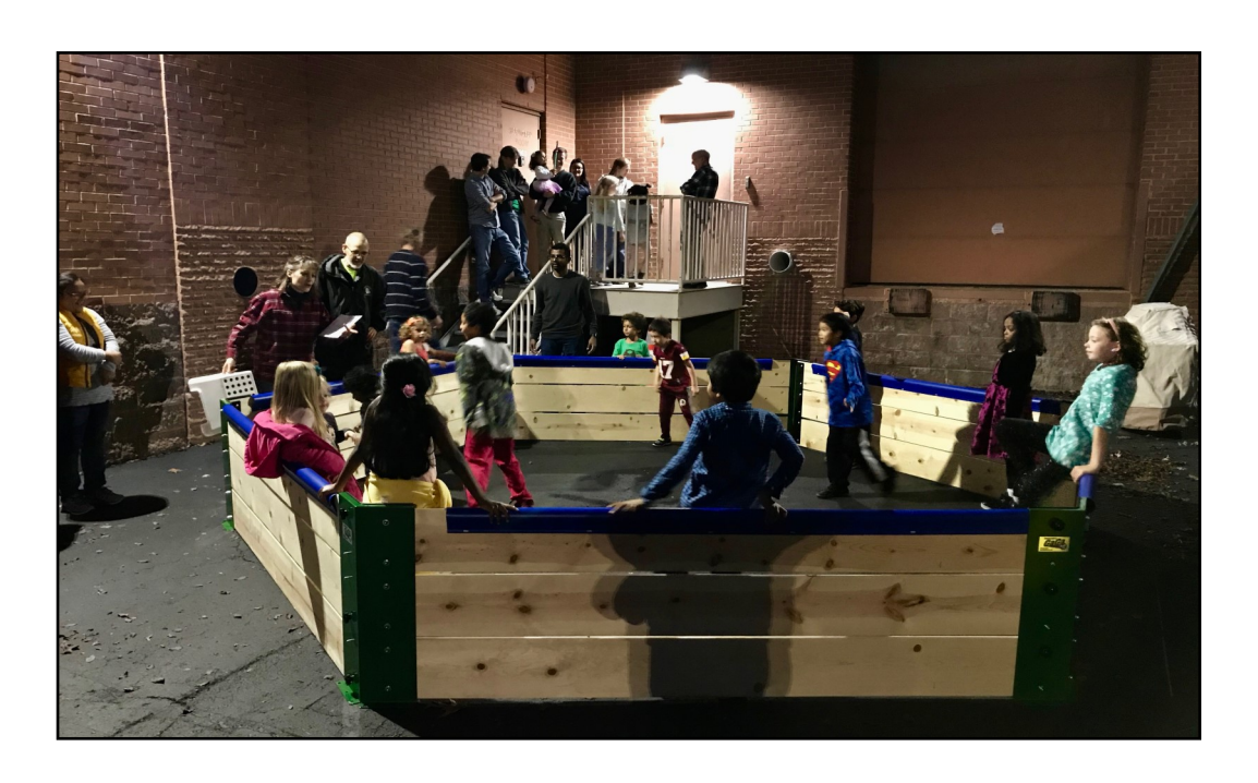
First live test!