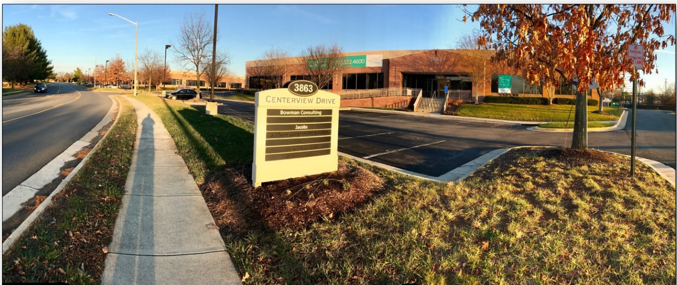
Epiphany is exploring moving to 3863 Centerview Drive near the intersection of Route 50 and Route 28 in Chantilly.