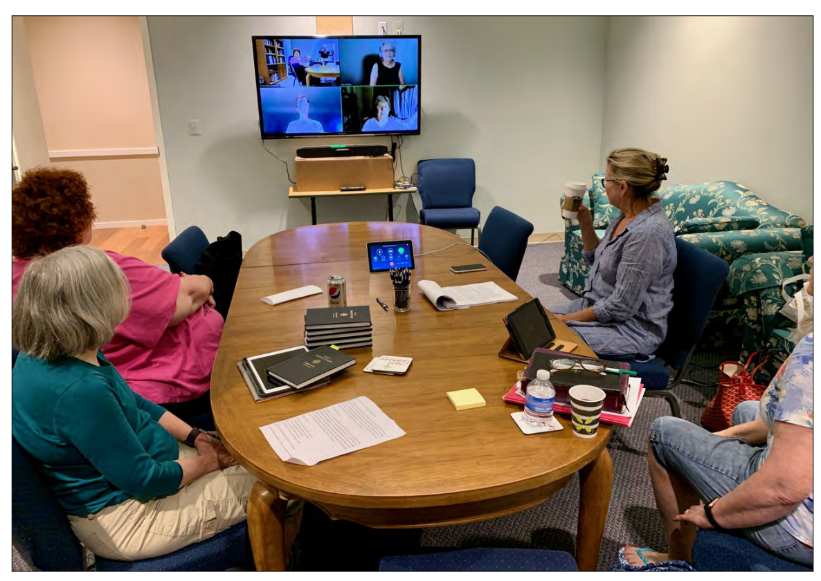
Members of the Monday morning women's group try out the new video conference system in the Epiphany library during an early test-run.

Over the last few months one pattern we have seen again and again at Epiphany is homegroups, ministries and others needing to meet in-person and remotely at the same time. We have made this easier at Epiphany with the installation of PolyStudio video conference sound bar and camera system along with a large screen in the library. The system doesn't require a computer to operate and can launch a meeting remote members can join from wherever they are in a couple of clicks. If you would like to make use of this new tool for meeting together at Epiphany, please contact Mtr. Pamela to get on the calendar.