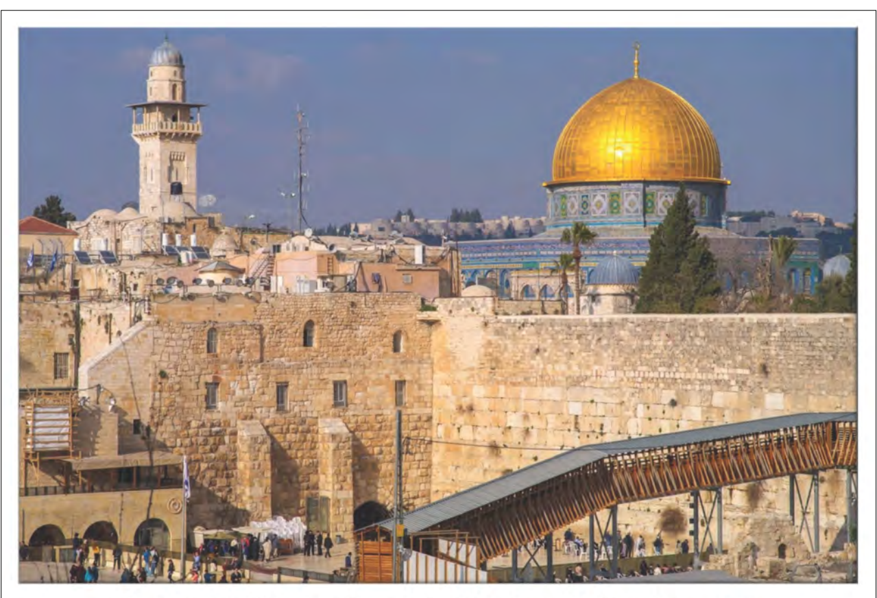
The Dome of the Rock and the Western Wall in Jerusalem