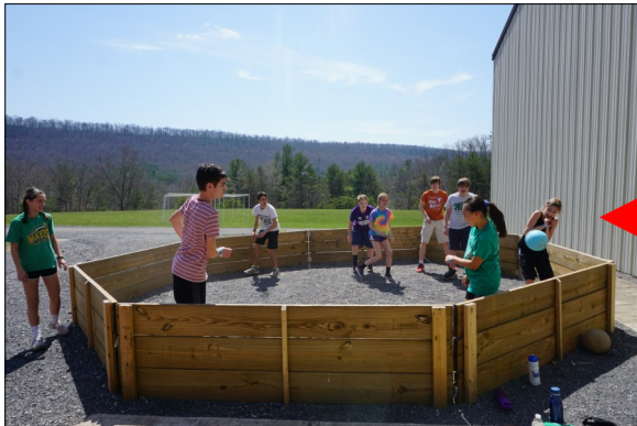
Gaga ball: a form of dodge ball in an arena. Our guys & gals are champs!