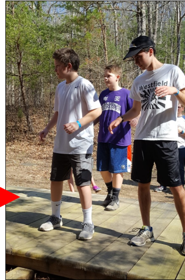
Three guys on platform try to keep it level while adding the entire team to it. Not an easy task to do while SILENT!