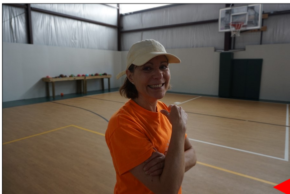
Sometimes the youth leader has to flex her muscles to make students listen!