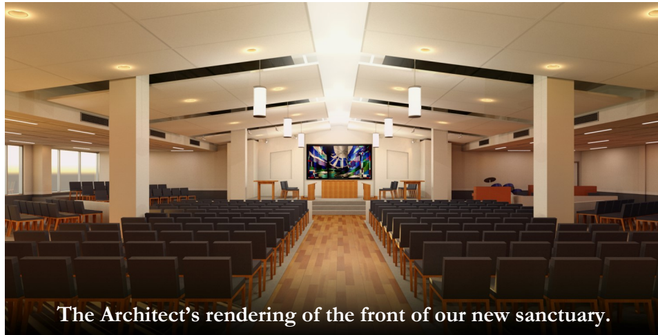
The Architect's rendering of the front of our new sanctuary.