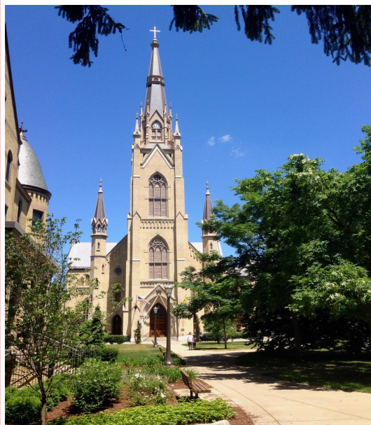
Notre Dame University’s Basilica of the Sacred Heart

But things did get a bit awkward during a daily chapel service, when our hosts commemorated St. Thomas More. Why? Well, Thomas More was one of Henry VIII’s closest friends and advisors until Henry decided to initiate the English Reformation. Thomas More couldn’t support Henry in this step. He was executed for his disobedience. Thomas More’s last recorded words were “I die the King’s good servant, and God’s first.”