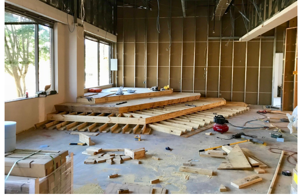
Choir risers under construction in the sanctuary.

Painting and Moving: We hope and expect to work as a congregation on both of these tasks as we get closer to our moving date. Please stay tuned for details and opportunities to participate.