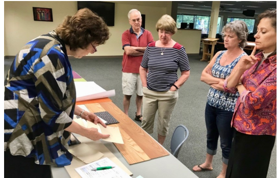
Members of the Build-Out Committee look at paint, carpet and flooring options for our new location.

Capital Campaign: The last month has been very encouraging. Giving is now over 85 percent of our goal ($677,446 given toward a goal of $800,000) with 80 Epiphany families participating. That said, the last 15 percent is