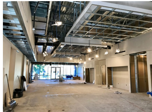
Epiphany's new fellowship hall.