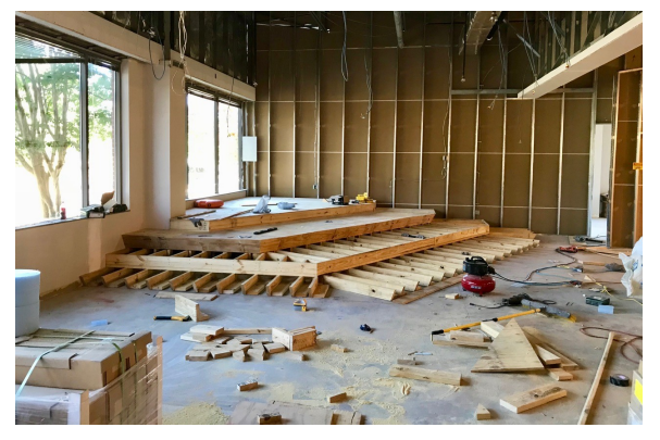
Choir risers under construction in the sanctuary.

Painting and Moving: We hope and expect to work as a congregation on both of these tasks as we get closer to our moving date. Please stay tuned for details and opportunities to participate.