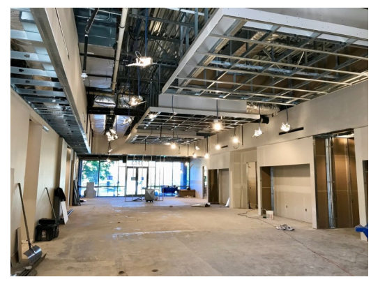
Epiphany's new fellowship hall.