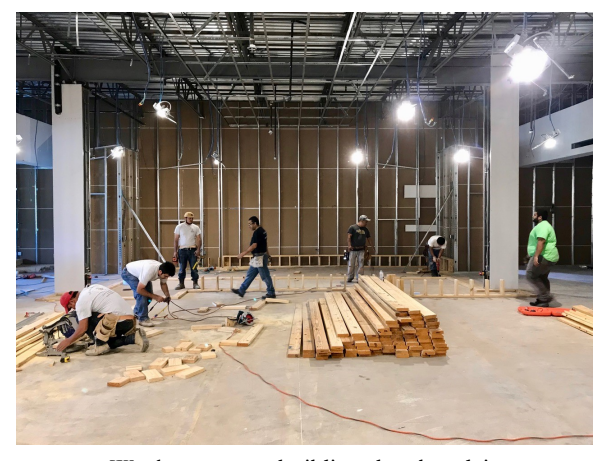
Work crews are building the altar dais n the sanctuary.