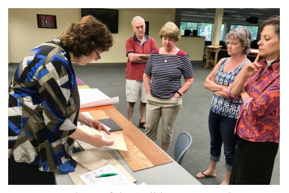
Members of the Build-Out Committee look at paint, carpet and flooring options for our new location.

Capital Campaign: The last month has been very encouraging. Giving is now over 85 percent of our goal ($677,446 given toward a goal of $800,000) with 80 Epiphany families participating. That said, the last 15 percent is