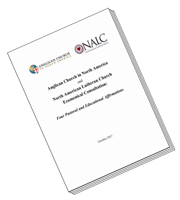
https://s3.amazonaws.com/acna/ACNA-NALC Four Affirmations Oct2017.pdf

The participants of the ACNA/NALC Ecumenical Consultation