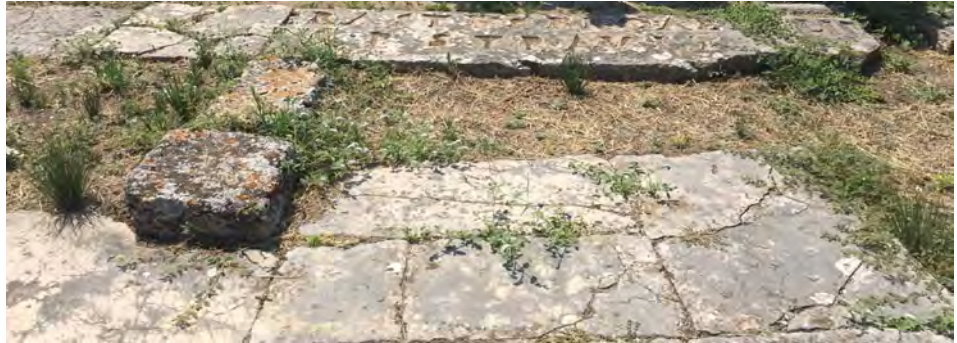
Here is the Erastus engraving (top of picture). There used to be bronze letters but they are no longer there

Last Sunday we had the privilege of baptizing three new believers. It should have been four but one sent us an sms like an hour before the service. I must say that this is a first for me. The message read "Hello, I must go and see about the possibility of a job this morning in