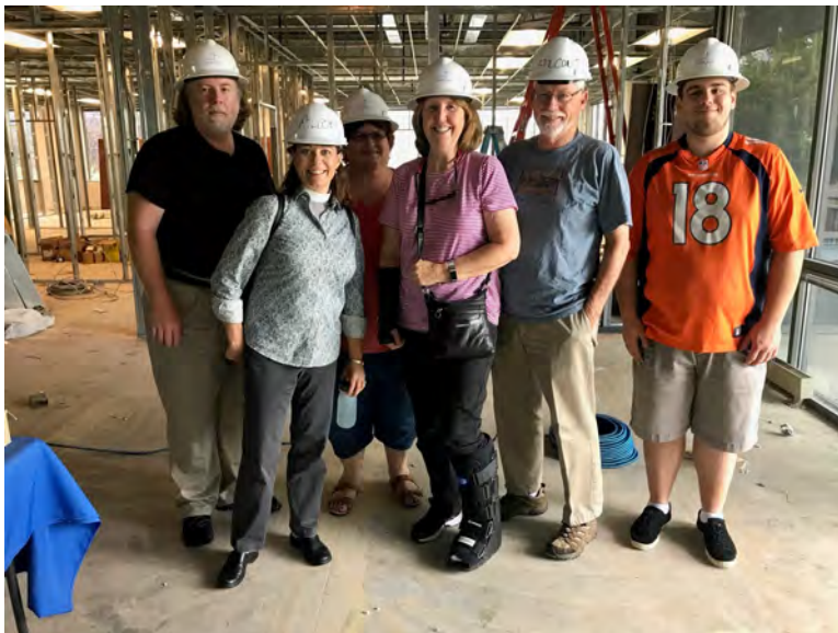
Epiphany staff in the entryway near what will be the church offices.