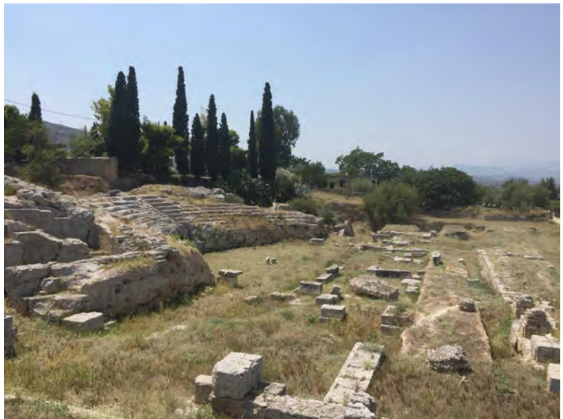
Close to what used to be a Roman amphitheater

One of the highlights of our time was a visit to the site of ancient Corinth. To be where Paul had made tents and preached and ministered with Aquila, Priscilla, Timothy and Silas was fantastic. Our guide was explaining that for quite a few years there was a group of scholars very critical of the Scriptures headquartered in this area. He went on to say that they were extremely critical of the Scriptures attacking its credibility at every turn. For one thing they took Paul to task for mentioning Erastus (Rom 16:23) as the city treasurer of Corinth. They argued that there was no trace of such a person having been treasurer for Corinth. They mocked the Scriptures saying there was no way such an important official would be so named. Erastus comes from the root 'erao' (to love) and could be translated beloved, good-looking or sexy. They were having a field day with this until an engraved stone was discovered in 1929 in a public square of Ancient Corinth that read: ERASTUS - PRO - AED S-P- STRAVIT (Erastus procurator aediles sua pecunia stravit) In essence it says that Erastus having served as city treasurer donated from his own money this paved road to express his gratitude for having had the honor of serving the city). I wonder if the critics went to see this site. I suspect that they probably said that it was not conclusive but, hey, same town, same time period, very unusual name ... what are the odds ?