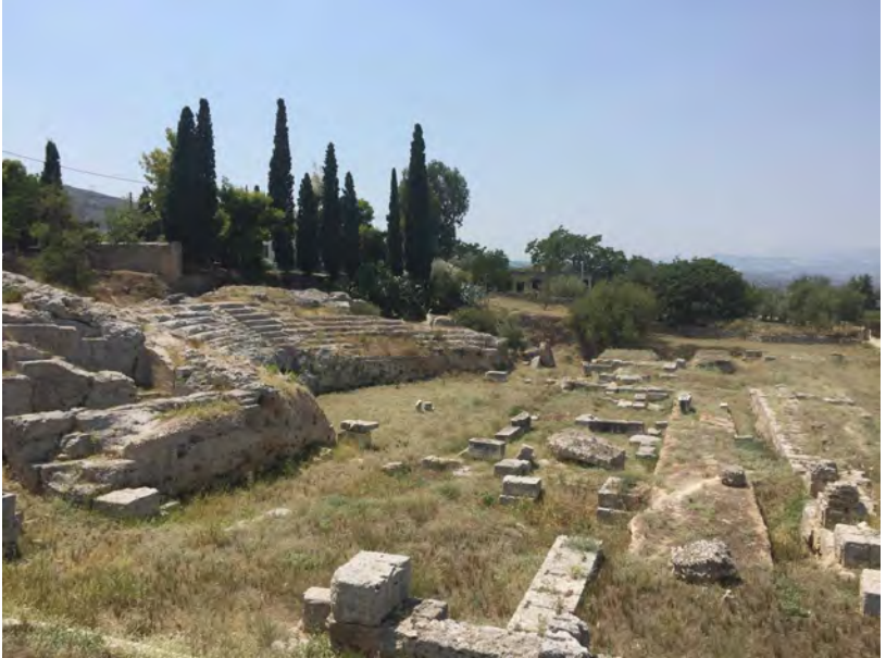
Close to what used to be a Roman amphitheater

a public square of Ancient Corinth that read: ERASTUS - PRO - AED S-P- STRAVIT (Erastus procurator aediles sua pecunia stravit) In essence it says that Erastus having served as city treasurer donated from his own money this paved road to express his gratitude for having had the honor of serving the city). I wonder if the critics went to see this site. I suspect that they probably said that it was not conclusive but, hey, same town, same time period, very unusual name ... what are the odds ?