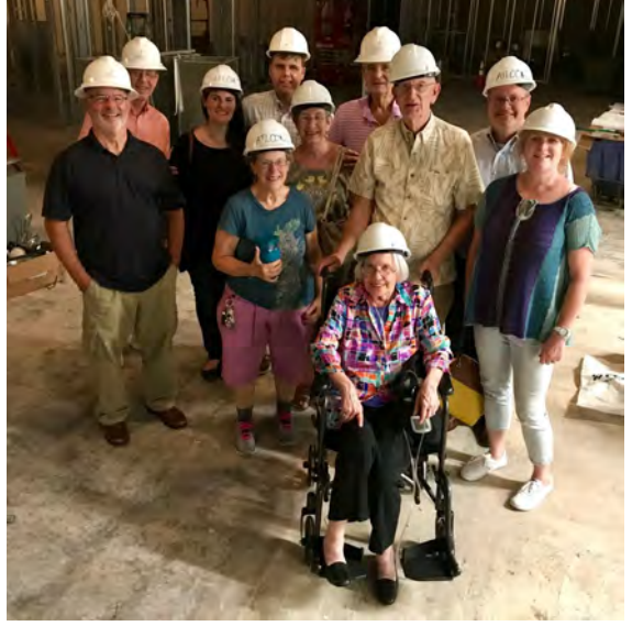
Epiphany staff in the entryway near what will be the church offices.