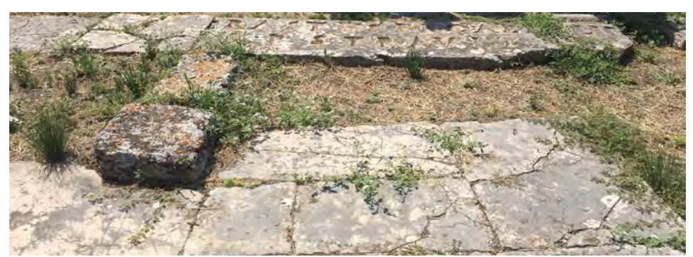
Here is the Erastus engraving (top of picture). There used to be bronze letters but they are no longer there

Last Sunday we had the privilege of baptizing three new believers. It should have been four but one sent us an sms like an hour before the service. I must say that this is a first for me. The message read "Hello, I must go and see about the possibility of a job this morning in