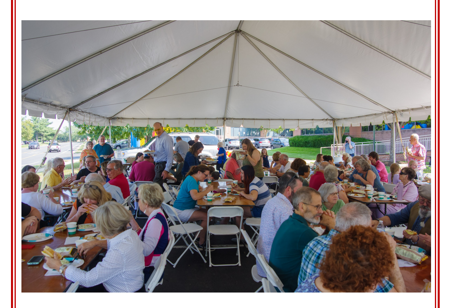
As we did last year, the center of our Fall Kickoff party was a big tent in the parking lot where we had a chance to connect with each other over a catered meal.

Inside the fellowship hall, Epiphany ministries shared information about what they do and looked for those interested in serving with them.