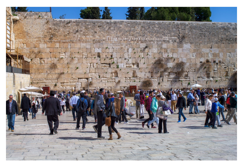
Going to the Western Wall (or as it is sometimes called, the Wailing Wall) where Jews have prayed since the destruction of the Temple by the Romans in AD 70 is an amazing experience.