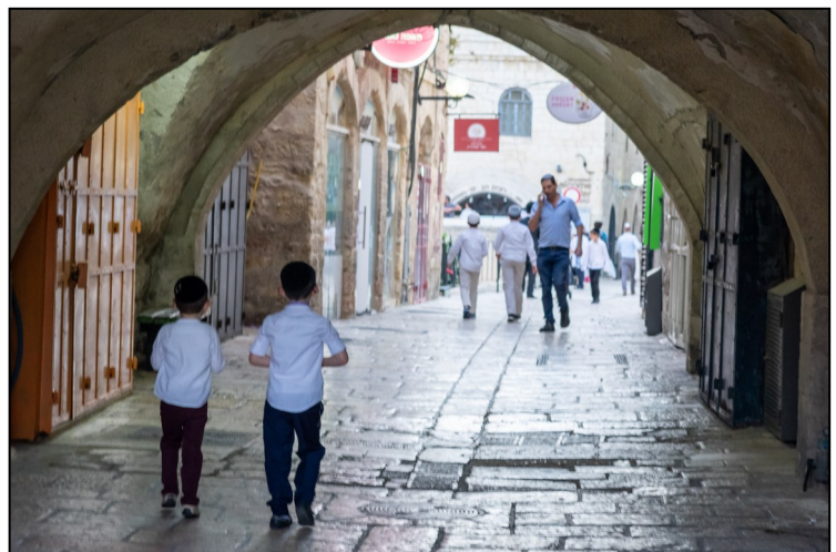
Boys on their way to Sabbath Prayers, Old City Jerusalem.