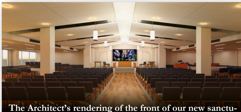
The Architect's rendering of the front of our new sanctu-