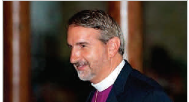
The Rt. Rev. Dr. Foley Beach of the Diocese of the South is elected the new Archbishop of the Anglican Church in North America.

The Anglican Church in North America consists of 112,000 Anglicans in nearly 1,000 congregations across the United States, Canada, and Mexico